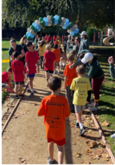
Cool Cats Fun Run

Highlights from last year's programs and staff made possible by your contributions to One Community LG: