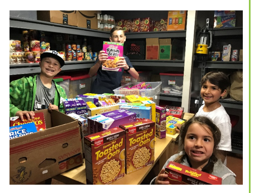
Stocking the Shelves at House of Hope.