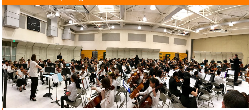
The combined RJ Fisher and Los Gatos High orchestras perform.

All through the district spring concerts are taking place.