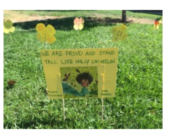
Conversation Starter: "What advice would you give your parent or caring adult?"

This month's book <u>Stand Tall, Molly Lou Melon</u> helps students identify and be empowered by caring adults in their lives.