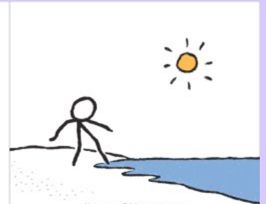
I'm an OK swimmer.

This book encourages and empowers children to discover their own individual strengths and passions. And, by trying new things, being just OK may (with practice) lead to being great.